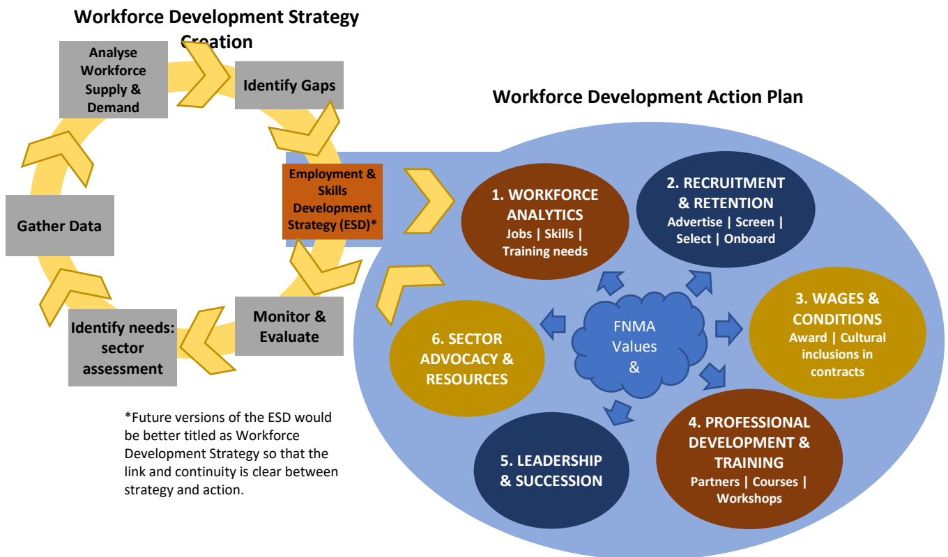
Figure 1. Workforce Development Framework

The ESD, commissioned by First Nations Media Australia (FNMA), proposes the rationale and some target end states for workforce development. This plan outlines a framework that shows where the strategy sits in a continuous improvement loop and how it links to six components as the keys to implementation. The Workforce Development Framework is shown here in Figure 1. Our thinking and design of this framework has been informed by work done by the Children’s Bureau and the National Child Welfare Workforce Institute, in 2015 1 .