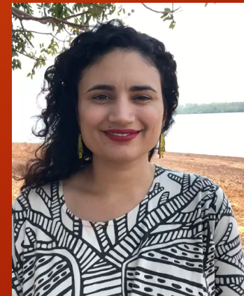
Video Welcome Minister Lauren Moss NT Minister for Corporate and Information Services